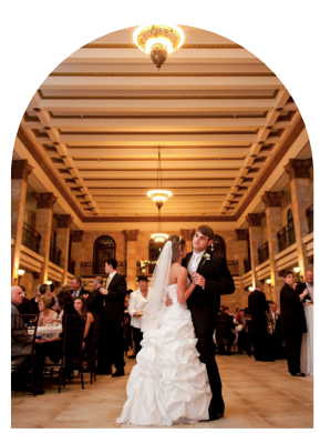
Calcasieu Marine Bank